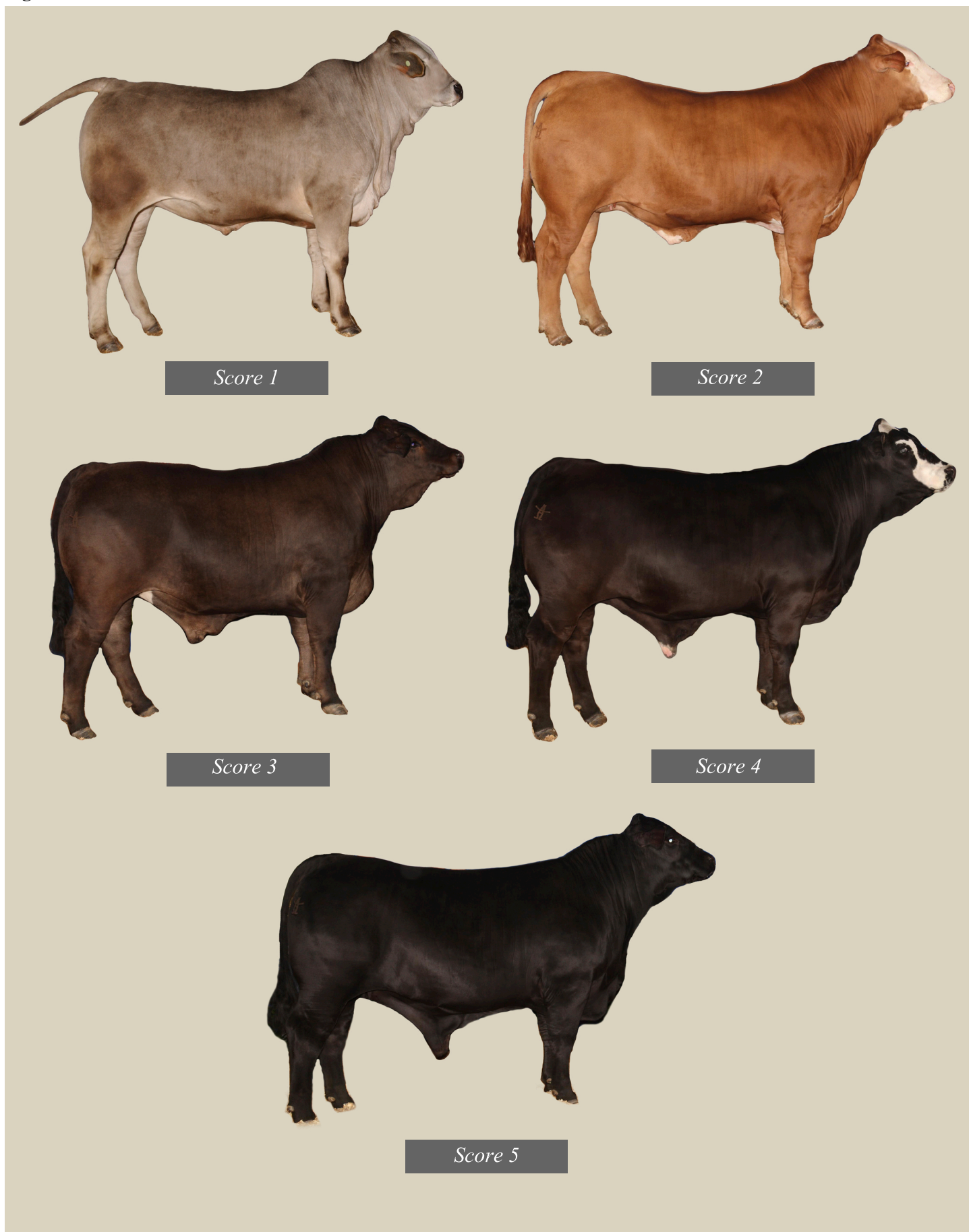
Figure 1. Sheath Scores