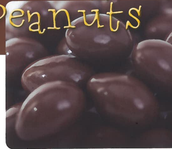
Cacahuates con Chocolate