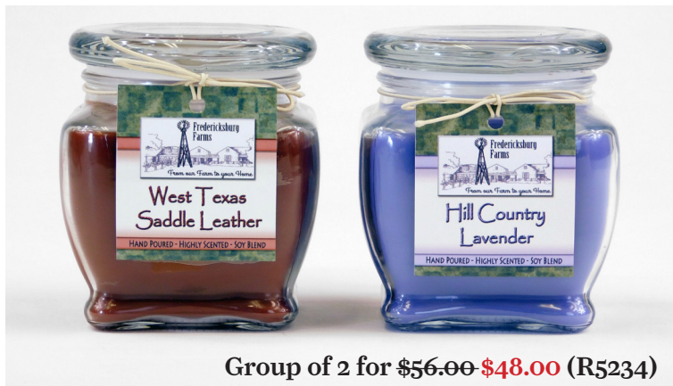
Group of 2 for $56.00 $48.00 (R5234)

Juicy orange and soft, smooth vanilla scent combine and may remind you of a favorite childhood ice cream treat in this soy-based long burning candle.