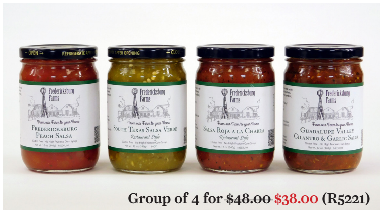
Group of 4 for $48.00 $38.00 (R5221)