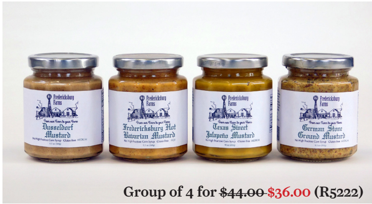
Group of 4 for $44.00 $36.00 (R5222)