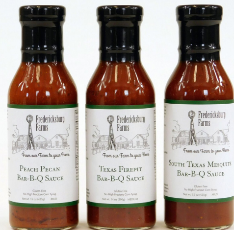
Group of 3 for $36.00 $27.00 (R5225)

We created this sauce which combines tomatoes, Worcestershire sauce, ketchup, garlic and our secret spice blend to make a Texas barbecue sauce that is great on smoked brisket, pork, chicken and even shrimp.