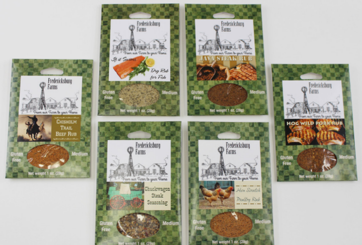
Group of 6 for $48.00 $29.00 (R5231)