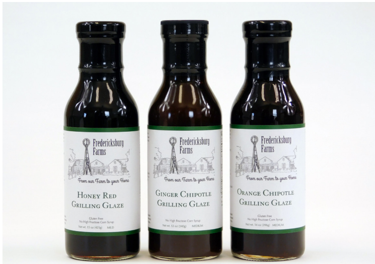
Group of 3 for $42.00 $33.00 (R5226)