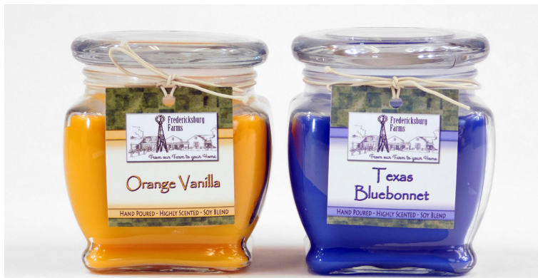
Group of 2 for $56.00 $48.00 (R5235)