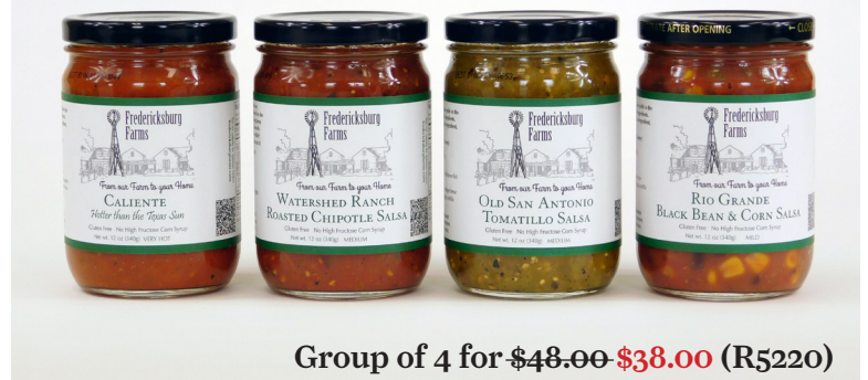
Group of 4 for $48.00 $38.00 (R5220)