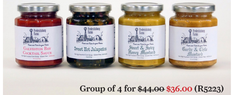
Group of 4 for $44.00 $36.00 (R5223)