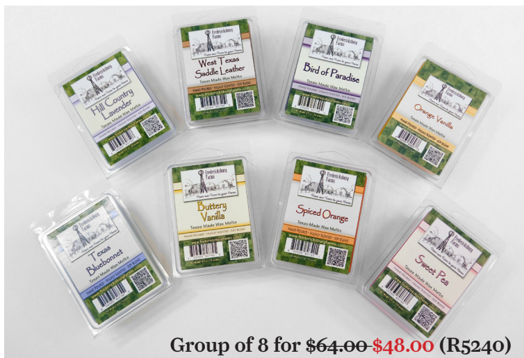
Group of 8 for $64.00 $48.00 (R5240)