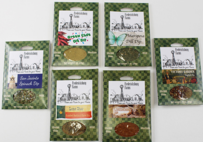
Group of 6 for $42.00 $29.00 (R5230)

This savory rub with its subtle flavors of garlic, dill and other spices really adds a delicious yet delicate seasoning to any kind of fish.